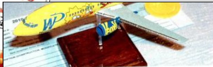
oh! 1/144 Boeing 737 in Simpsons livery