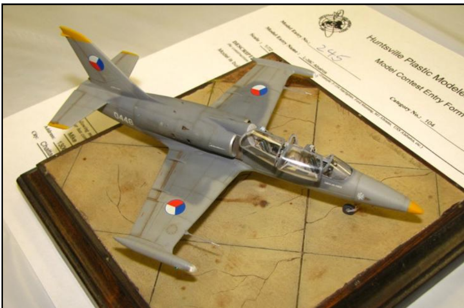
Mike Moore's L-39C Albatross in 1/72 scale made its debut at this show.

has the steps down pat to putting on a solidly good show. Upon arrival we placed our models on the contest tables. Much of the morning was spent talking with others about our show in January. There seems to be a