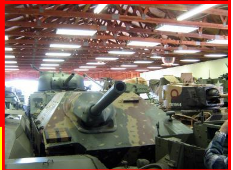
These three photos [outlined in red] are from the Virginia Museum of Military Vehicles