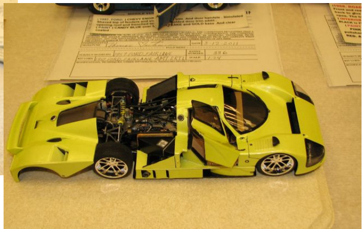
I actually took pictures of cars!